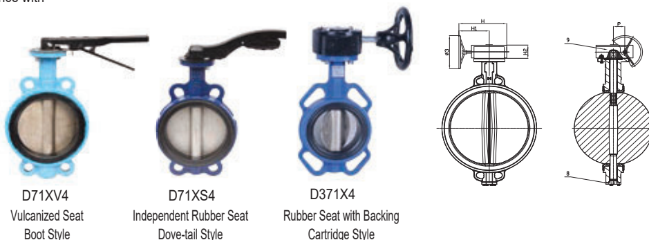
D71XV4 Vulcanized Seat Boot Style

Note: For special material request other than standard specification, please indicate clearly on the inquiry or order list.